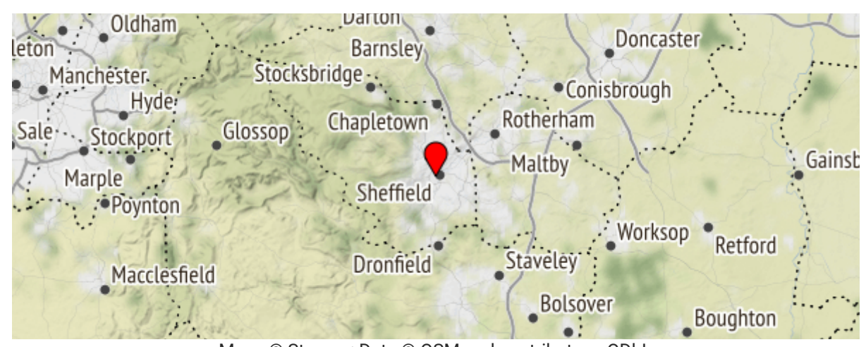
Maps © Stamen; Data © OSM and contributors, ODbL

Together we can do this tell your friends we can do this.